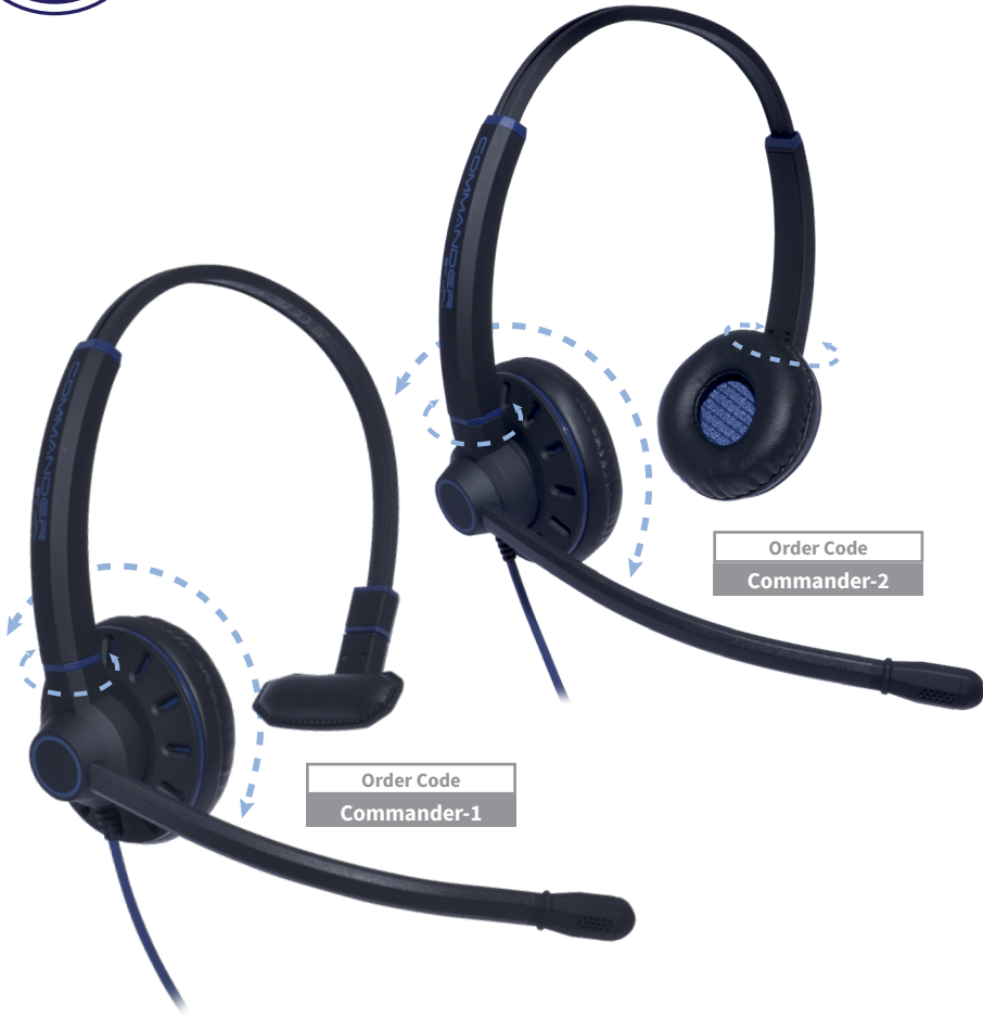
Order Code Commander-2