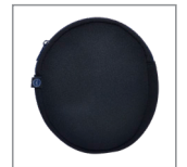
SOFT SHELL CARRY CASE