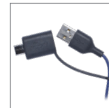
USB-A / USB-C ADAPTER